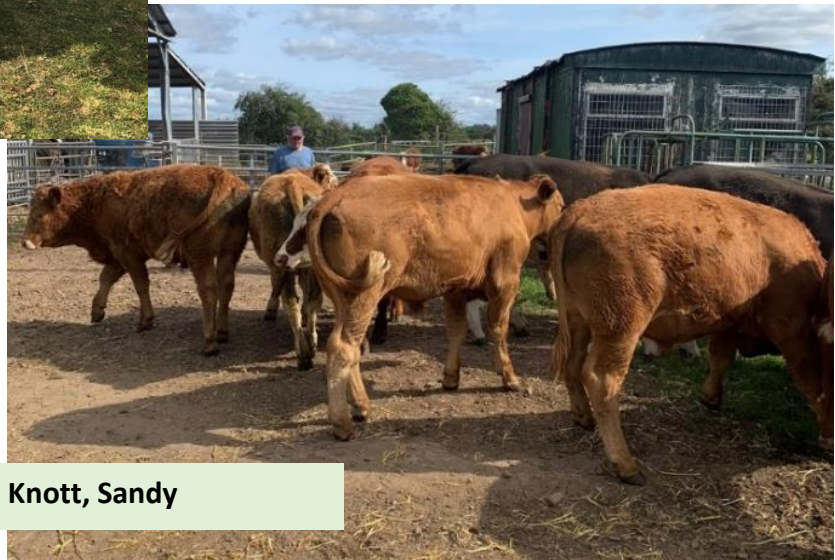
SG Knott, Sandy